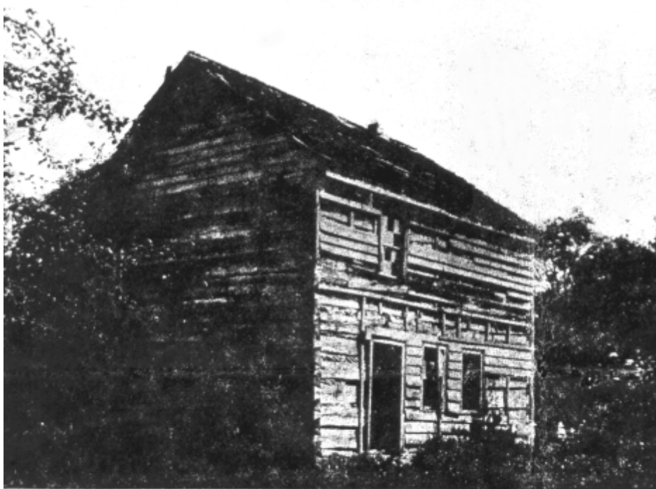
WESTFALL'S FORT, TYGARTS VALLEY, BEVERLY, BUILT 1774